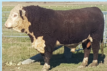
2022 a great example of a modern well-balanced, R2 horned Hereford bull Est weight ~800kg.

But I don't think it is just a size issue, there are some geometric things that have occurred in our pursuit of more meat and a certain aesthetic.