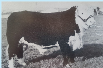
1963 R2 bull Navigator GEM. Record price Hereford bull. Probably ~500kg.

A 1000kg animal throwing all its weight in the air and forward in an attempt to thread a bit of fibro-elastic tissue through a 10cm target (without looking) is bound to cause some issues eventually. Like the higher injury rate in modern super-rugby players compared to the amateur era, it appears the injury rate in bulls has increased as bulls have got bigger. It is known also that leaner commercial bulls (of the same genetics) have lower injury rates than fatter, heavier bulls.