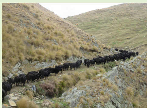
Fossil Creek cows coming in to be sorted into their calving dates