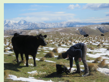
Date scanning at Fossil Creek helps time the calf tagging round perfectly