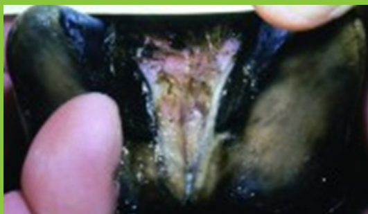
Score 2 – OID (Ovine interdigital dermatitis /scald)