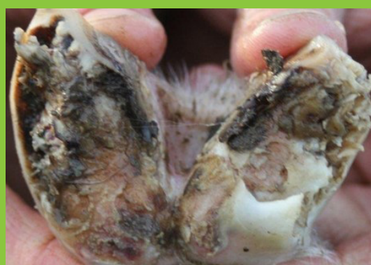
Score 4 – Active footrot Advancing under-run of hoof