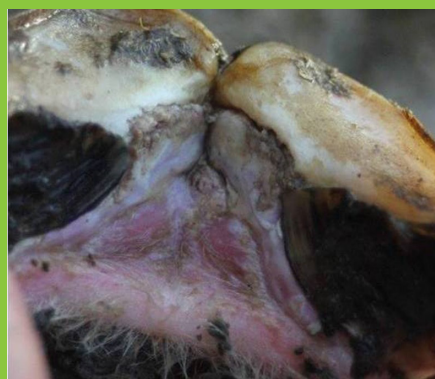
Score 3 OID – Early footrot Starting to lift at the heel bulbs