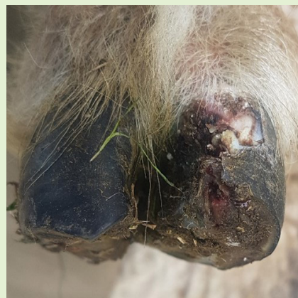
A toe abscess. Not contagious. Very painful