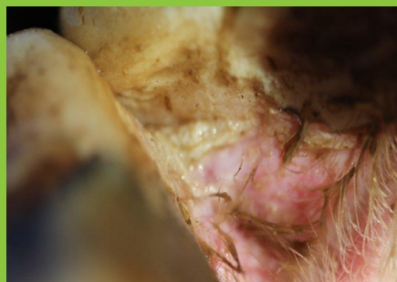
Score 1- Water maceration/OID

Footrot scoring is important to determine when to inspect feet. Scores 1,2,3 indicate footrot is spreading. Scores of 0 or 4 indicate footrot is not spreading. This is the time to inspect feet.