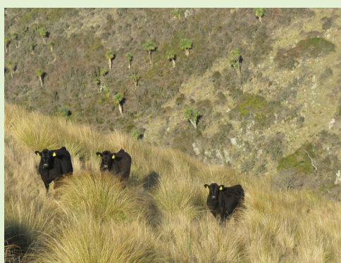
Date scanning allows the heifers to stay in their Wintering blocks for longer