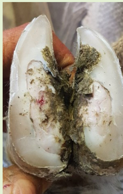
Footrot. Grade 4 lesion with under-run exposed

This foot scoring indicates footrot is spreading on this farm.